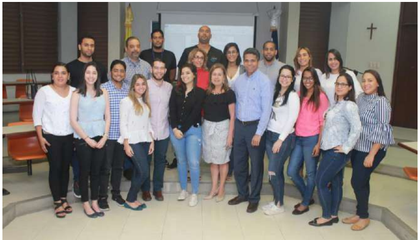
Third Scientific Meeting of IADR-CS “Abstract Writing” at Santo Domingo, Dominican Republic on January 11 and 18, 2018.