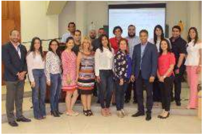
Scientific meeting at Pontificia Universidad Católica Madre y Maestra, Santo Domingo, Dominican Republic on June 6, 2017.