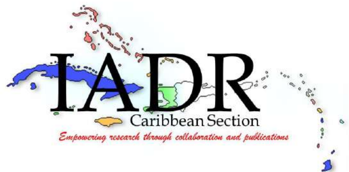
The official logo of IADR Caribbean Section

Empowering research through collaboration and publication